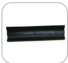
Back Skid Seal BLAST558-015 (2 required)