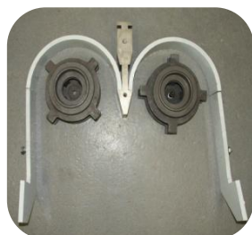
Tuning Kit BLAST-018 (2 required)