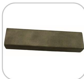
Magnets Front BLAST558-019