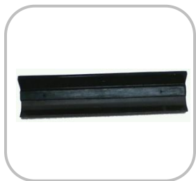
Back Skid Seal BLAST558-015 (2 required)