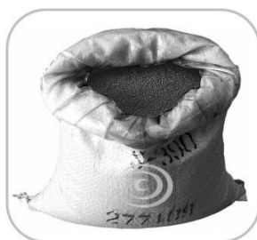
Steel abrasive / Shot 390 Grade 1.0 – 1.4mm – SHOT0390 460 Grade 1.2 – 1.7mm – SHOT0460 550 Grade 1.4 – 2.0mm – SHOT0550