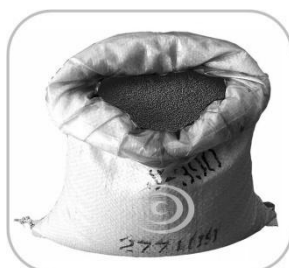
Steel abrasive / Shot 390 Grade 1.0 – 1.4mm – SHOT0390 460 Grade 1.2 – 1.7mm – SHOT0460 550 Grade 1.4 – 2.0mm – SHOT0550