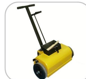
Magnetic Sweeper SWEEPER-001